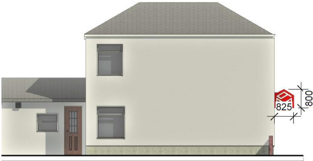
1:100 Side Elevation