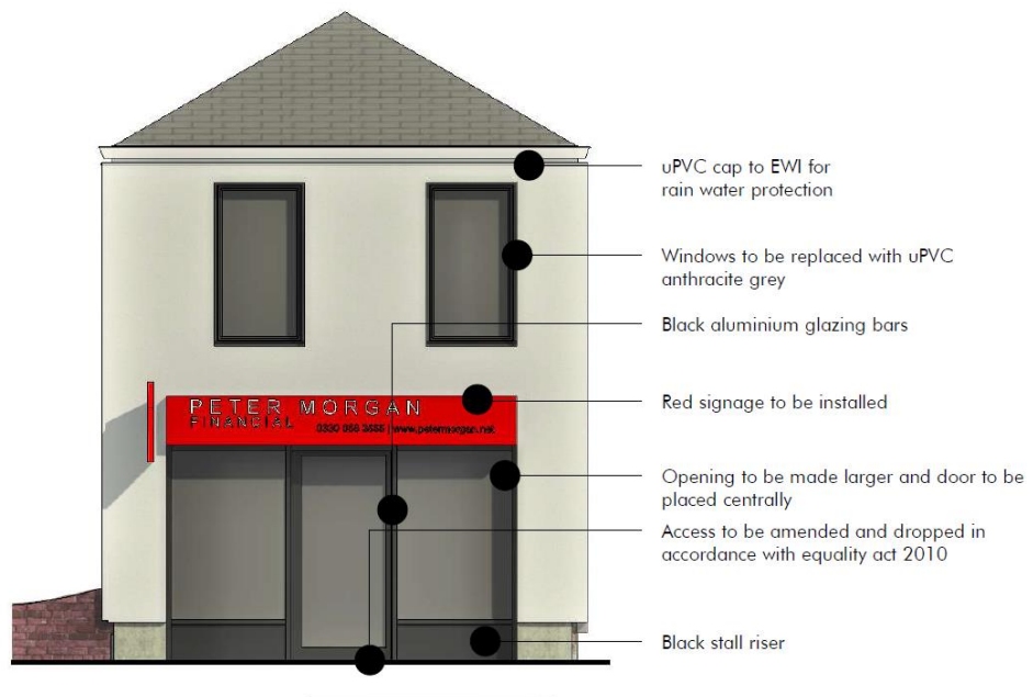
1:100 Proposed Front Elevation

Proposed elevations from planning consent Ref: P2022/0063: