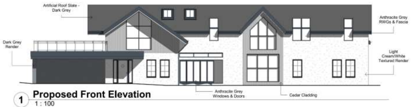
1 Proposed Front Elevation 1 : 100