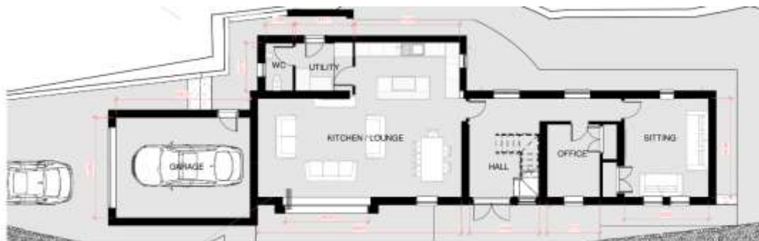
Proposed Ground Floor 1 : 100

Finally, in respect of Bedroom 3 (on the southern side of the dwelling) it is noted that it would have French-doors with glazed 'Juliet-balcony' railings in front. As this is a railing only, and not a full balcony area, it is considered that this would not create any unacceptable overlooking issues above and beyond that of a window – especially as the patio/amenity area to Number 26 would be approximately 17-18m away at an angle of 30 degrees. Members should also note that bedrooms 3 and 4 on the previous scheme were not required or conditioned to be fitted with obscure-glazing, and the scheme now proposed would not create any additional overlooking over and above that of the one already consented. Figures 6 and 7 (below) illustrate the proposed floor plans, together with those of the previous approved scheme (Not to Scale).