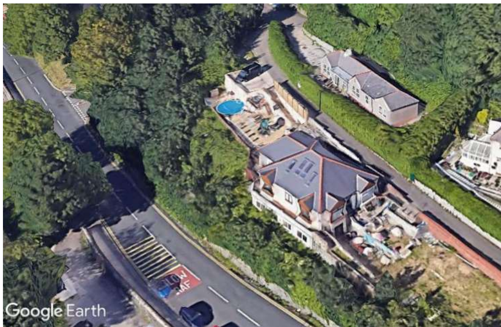
Figure 4 - Google Earth extract showing Number 26 in relation to the application site behind

Although the occupiers of Number 26 have stated that the existing fence is unauthorised and could be removed, this would consequently mean that the amenity area would no longer remain 'private' as it would be visible from pedestrians and vehicles using the access road serving Fernfield (which leads to approximately 13 further dwellings). It should also be noted that the windows to Bedroom 1 and 2 would be obscurely-glazed, to prevent any unacceptable overlooking issues into the amenity area, while the landing area