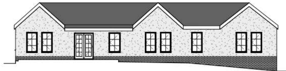
1 Existing Front Elevation 1 : 100

In respect of the roof extension element of this scheme, it is proposed to raise the ridge from its current height of approximately 4.6m to approximately 7.36m (measured in the centre). This is an increase of around 2.76m (compared to approximately 2.39m under the approved scheme). Additional windows are also proposed to all elevations, including roof-lights and a dormer. Figures 1, 2 and 3 below illustrate the existing and proposed front elevations (Not to Scale), as well as the previously approved scheme: